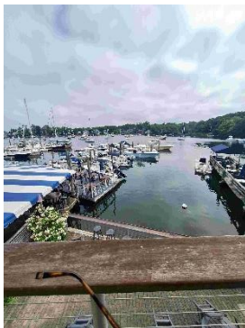
<-Looking out over Eel Pond in Woods Hole, MA from the Woods Hole Market upper deck.