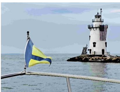
<-Leaving the Conn. River for 4th of July