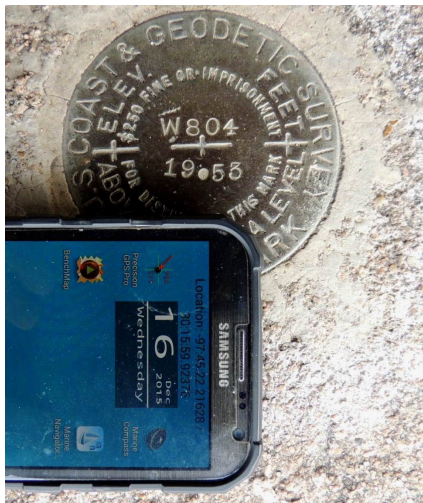
Cell phone in photo