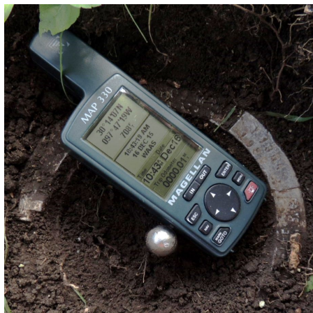
GPS in photo