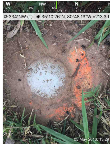
Solocator phone app