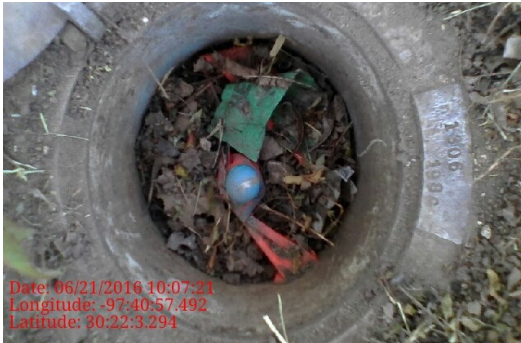
Geo Stamp phone app

Overprinting Lat/Lon and date using a photo editing software is not adequate... untamperable technology is asked for.