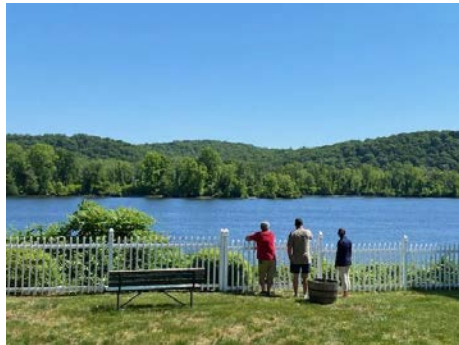
June Rendezvous