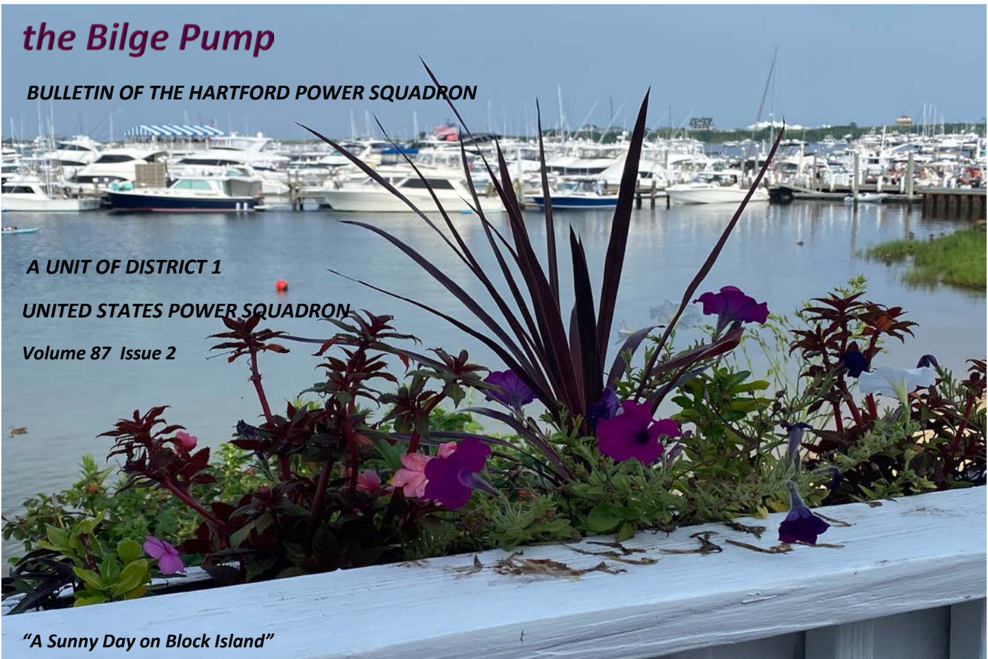
"A Sunny Day on Block Island"