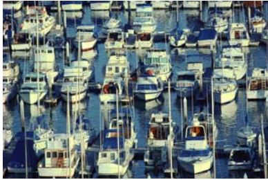
Y is for Yachts