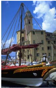
M is for Mast