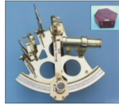
S is for Sextant