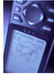
G is for GPS