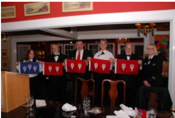
The 2018 Bridge