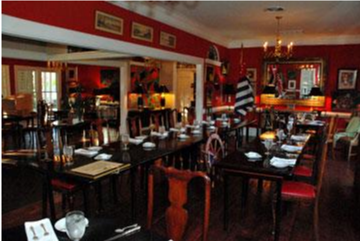
The Leaning Tree Dining Room