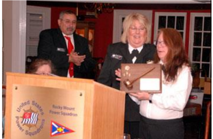
Bug is presented with her P/C plaque. (Note: One year late)