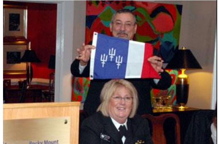
No! No! No!