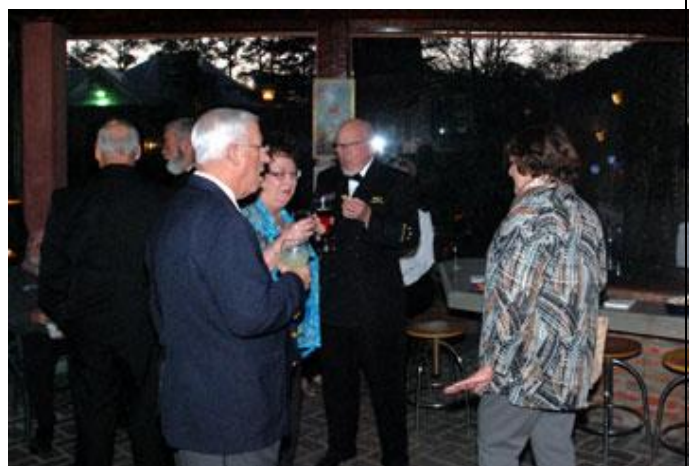
Drinks in the cottage.