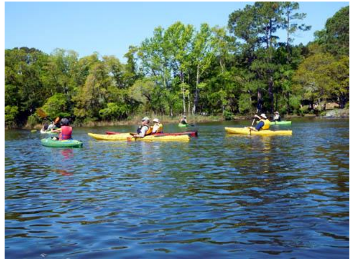
The creek cruise.