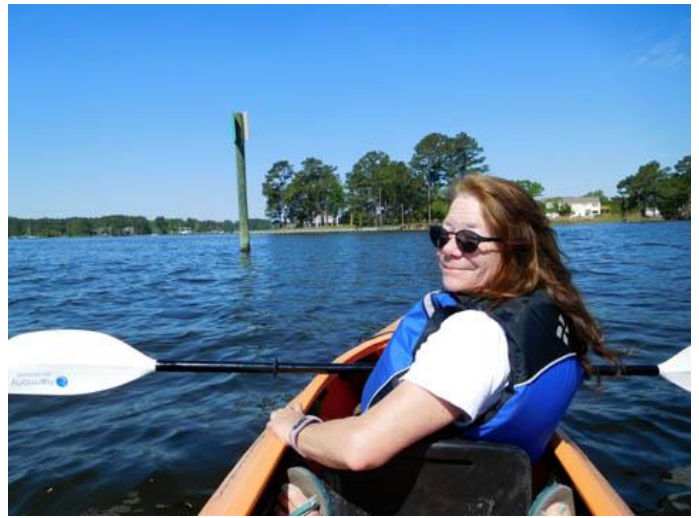
Bug at the front of the Kayak.