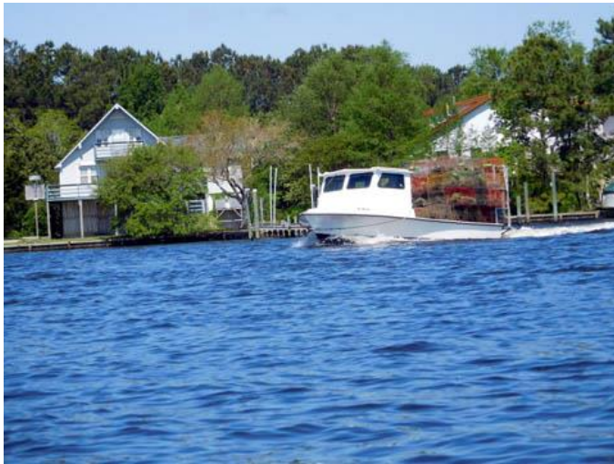
A crab boat cruising Green Creek.